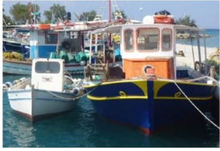
Corfu, North Ionian, Greece Sail