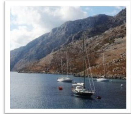
North Dodecanese, Greece Sail