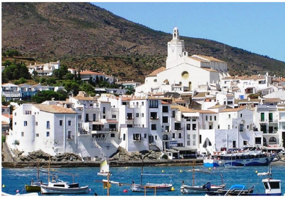
Costa Brava, Spain Sail