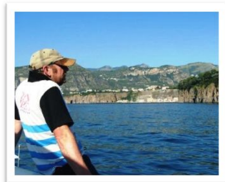
Amalfi Coast, Italy Sail